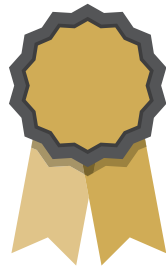
AWARD WINNING SALES & RENTALS